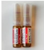
Injection into the muscle (0.4mg/ml)

Nasal spray absorption is lower than injectable, which means a higher concentration of naloxone is needed in nasal spray to reach similar effects. Both types are effective in reversing an opioid poisoning.