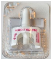
Nasal spray (4mg/0.1ml)