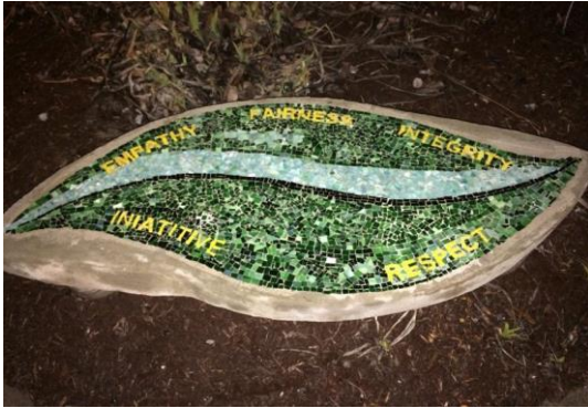
Attribute garden at Mount Albert Public School