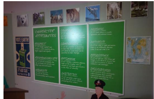
Community Safety Village – Whitchurch- Stouffville