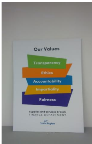
York Region Meeting Room