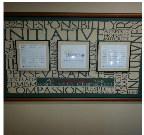
Cardinal GC hallway