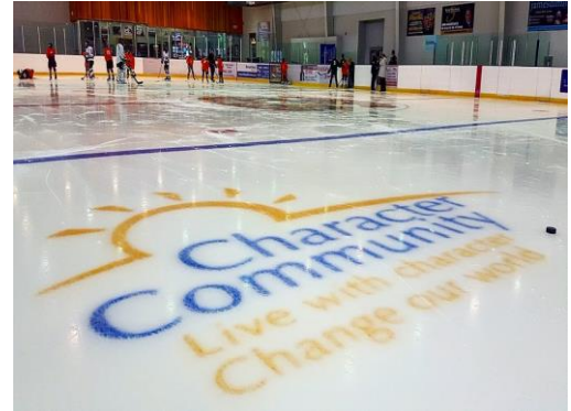
Ice surface Town of Aurora