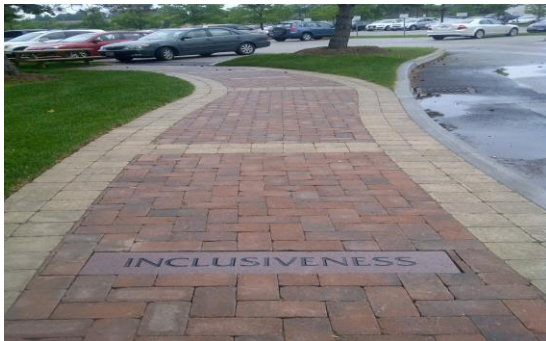
Town of East Gwillimbury walkway