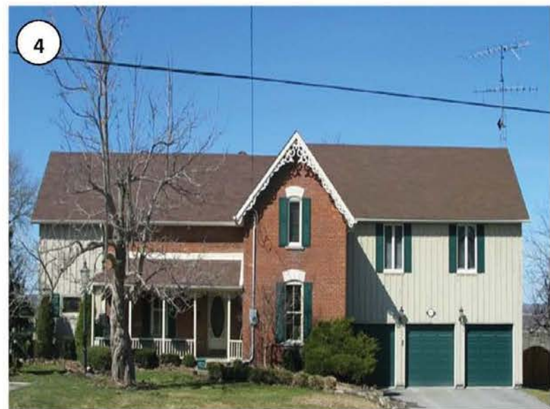
19014 Centre Street – listed – waiting TBD