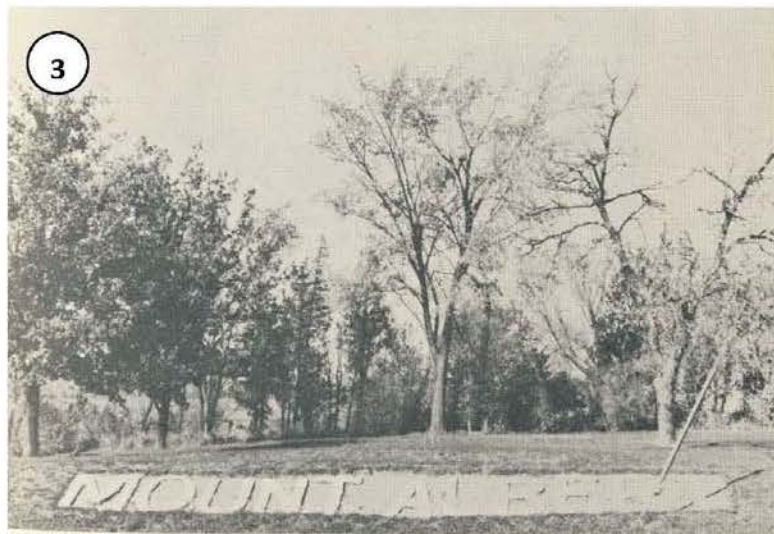
Birchard Gardens - Mount Albert