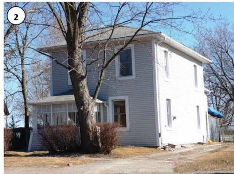
5631 Mount Albert Road – listed – south portion of Royal Oak Hotel