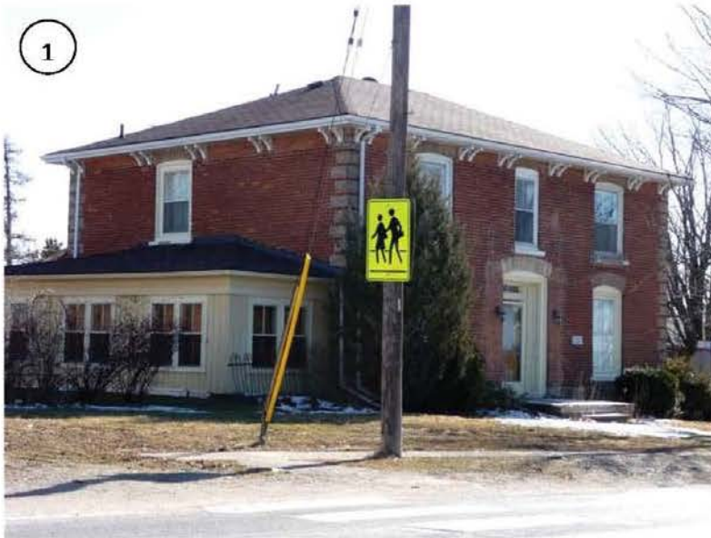
5623 Mount Albert Road – listed – John Stokes Hotel