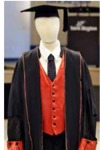
2015 York County Warden's ceremonial cap and robe (1955-1970).