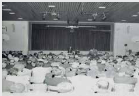
1970 Inaugural meeting of York Regional Council.