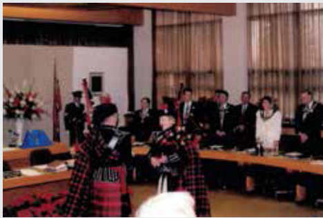
1991 Inaugural Meeting of York Regional Council, York Regional Police piper leading the procession into Council Chambers.