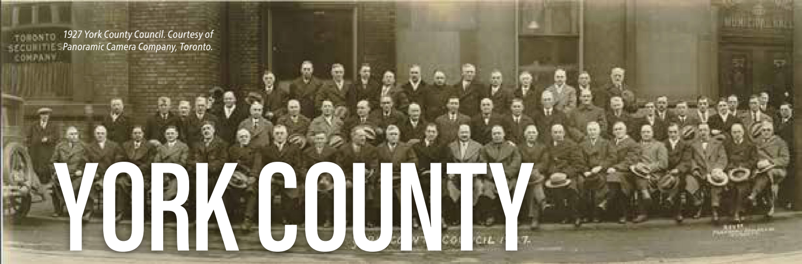
TORONTO 1927 York County Council. Courtesy of SECURITIES Panoramic Camera Company, Toronto. COMPANY