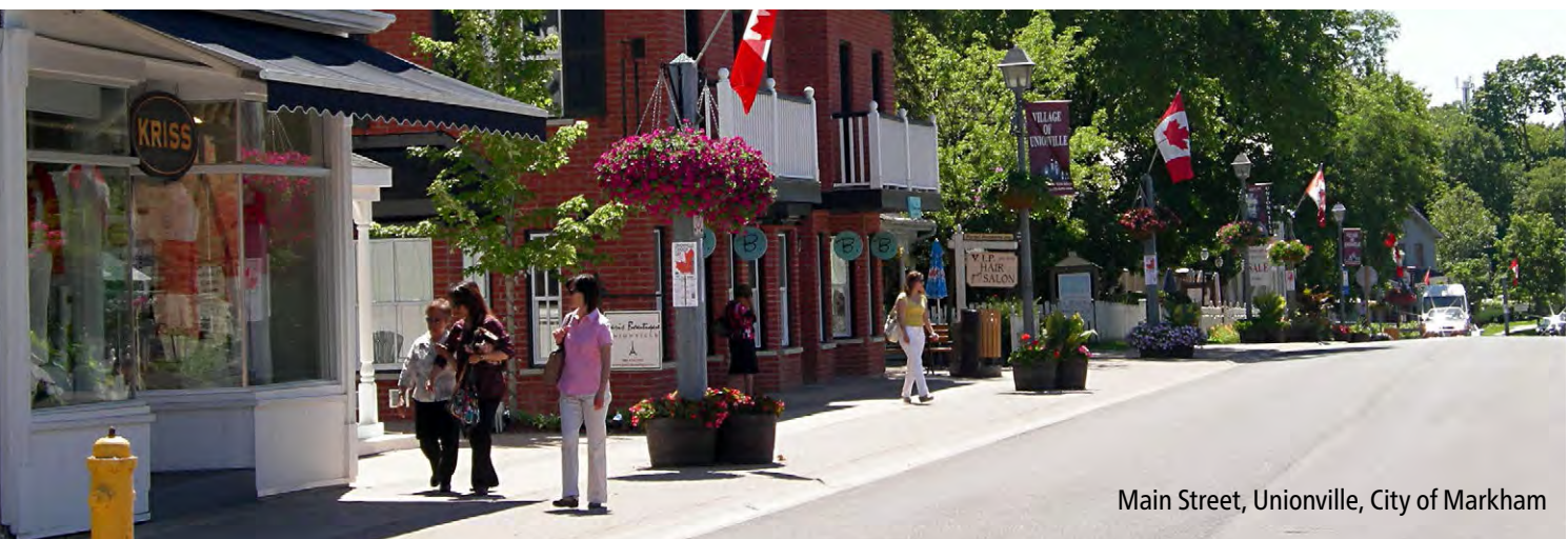
Main Street, Unionville, City of Markham

York Region's rich soils make agriculture a central part of York Region's heritage. Today, York Region has evolved into both an agricultural-based economy as well as a broad-based modern business economy including technology, manufacturing, smart healthcare, retail and personal services.